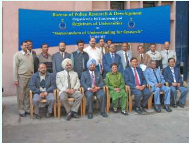
Registrars and BPR&D Officials, 31 Jan 2007

Sciences, Mumbai. 5. University of Lucknow, UP. 6. Banaras Hindu University, MoU by BPR&D with following Universities likely to be signed soon: