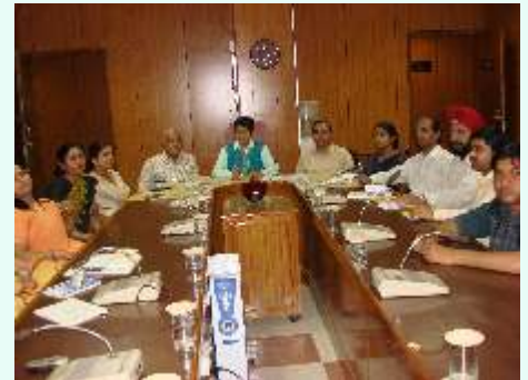
DG BPR&D with staff

This is a major boost to promote acquaintance with rules and procedure on an ongoing basis. At present, practical training is also being imparted in the divisions, at the desk level. The valuable contribution of the guest lecturer is gratefully acknowledged.