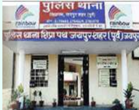
Shipra Path Police Station

It scored 100 points in three out of five criteria on which Posts