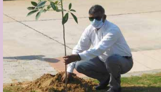
Tree Plantation at CDTI Jaipur