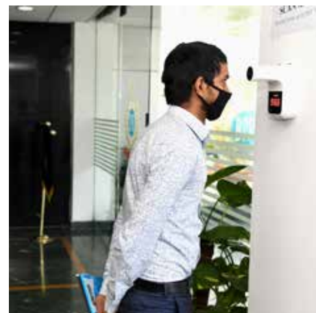
Wall mounted thermal scanner at BPR&D Reception