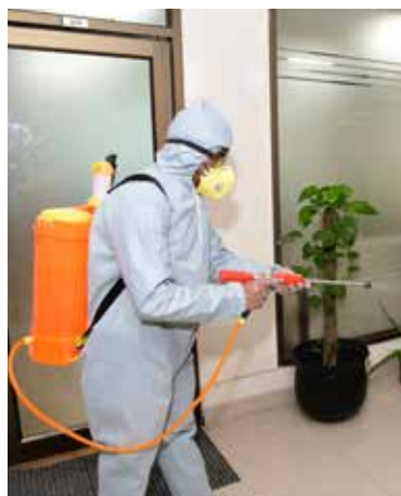
Sanitization work being done at BPR&D Headquarters