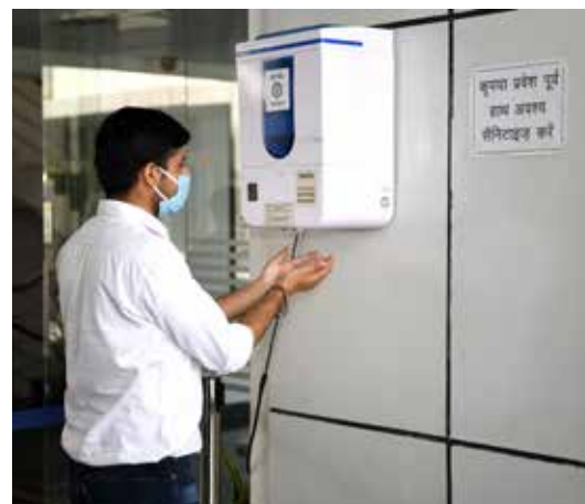
Wall mounted Hand Sanitizer Mist Dispenser