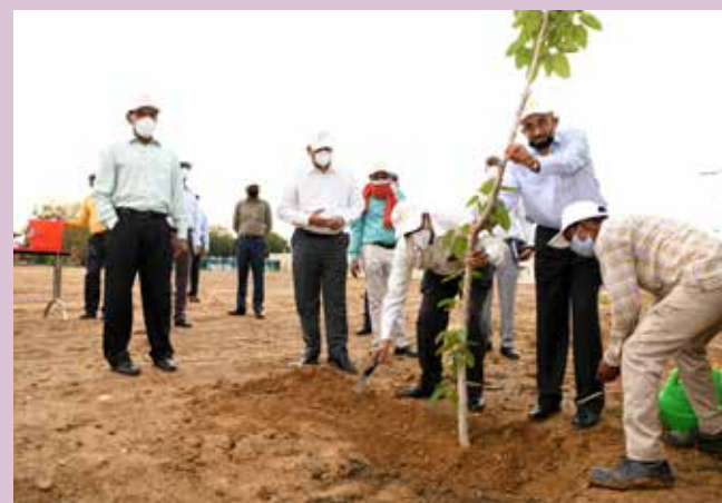
DG, ADG and officers / staff of the BPR&D planted saplings of various local species along with seasonal flowering plants.