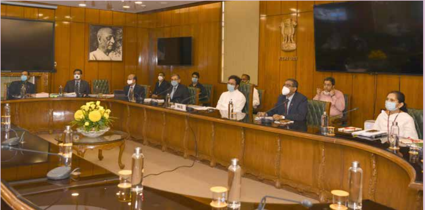
Sh. G. Kishan Reddy, Hon'ble MoS, Home, during the Annual Review of the BPR&D, on the 10 th June, 2020, at the North Block, MHA.