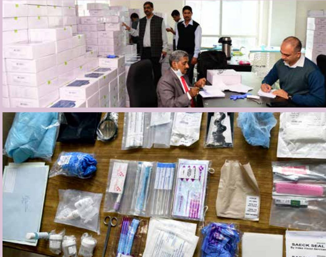
Sexual Assault Evidence Collection Kit : Pre-despatch Inspection

Officers and staff members of the Training Division went to great lengths to ensure collection and distribution of the kits, overcoming issues relating to storage, transportation and other logistics during a period of considerable difficulty. ●