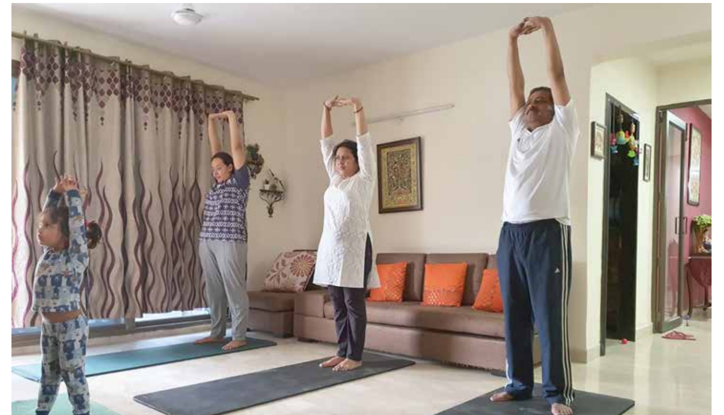
DG, BPR&D, at yoga session @home with family

"Yoga enhances our quest for a healthier planet. It has emerged as a force for unity and deepens the bonds of humanity. It does not discriminate. It goes beyond race, colour, gender, faith and nations.... Anybody can embrace Yoga. All you need is some part of your time and empty space. Yoga is giving us not only the physical strength, but also mental balance and emotional stability to confidently negotiate the challenges before us...."