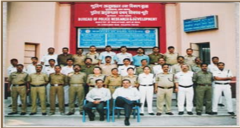
"Crime Scene Investigation" Course conducted by CDTS, Kolkata

A five-day Course was conducted at CDTS, Chandigarh from 3.3.2008 to 7.3.2008. Police officers from different parts of the country and abroad (Bhutan, Bangladesh and Maldives) attended the course. Out of 34 officers who attended the course four were from