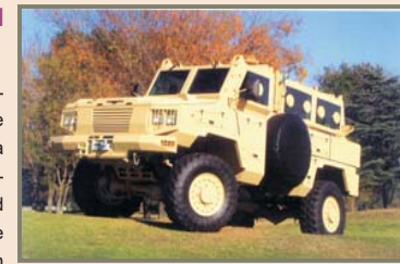
RG-31 Mine protected vehicle

A demo-cum-presentation was made on the features of Mahindra Specialized Vehicle called RG-31 Mine protected vehicle and Up-Armoured Scorpio in the BPR&D Headquarters on 9th April 2008. The main features