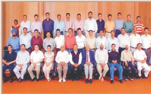
Course on Investigation of NDPS cases held at CDTS Chandigarh

abroad. The Narcotics Control Bureau and Central Forensic Science Laboratory, Chandigarh conducted the theory and practical sessions of the course.