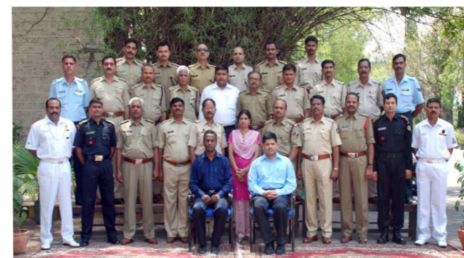
Participants of the course on Scientific Investigation at CDTS, Hyderabad

Central Detective Training School(CDTS), Hydrabad conducted three training courses on Scientific investigation during May-June, 2009. First course on "Custodial Violence and Scientific Interrogation" was organized from 4th to 15th May 2009. Fourteen officers participated in the course. The second course on "Criminal Psychology & Crime Investigation" was held from 18th to 22nd May 2009. Twenty seven officers from different police organizations were trained in the programme. The third Advanced Course on Scientific Investigation which began on 1st June 2009 and would last till 28th July 2009. Twenty officers from different parts of the country attended the course.